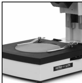
Extra large stage allows ample room for viewing specimen