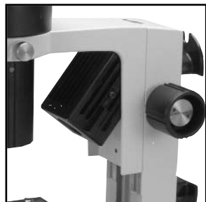
Adjustable light path assures optimal lighting of specimen