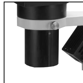
Smooth-moving turret allows for easy magnification change